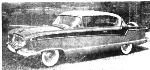
AMERICAN MOTORS Corp. will introduce the 1956 Nash at all dealerships November 17. This Custom car has a new V-8 220-horsepower engine, compared to the 208-hp. first year. Other horsepower in the Nash line include 130, 135 and 145-hp. autos.