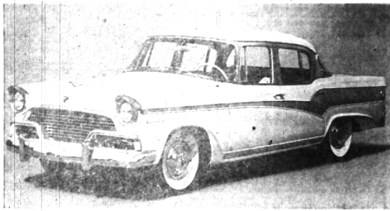
READY FOR its 1956 debut is Studebaker's President Classic 4-door sedan with 210 horsepower engine and new styling. There are 12 models in the President line. Local display is at Carkner's, 606 S. Woodward.