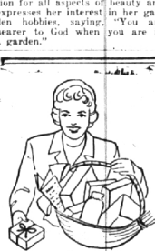
The Welcome Wagon Hostess

Will Knock on Your Door with Gifts & Greetings from Friendly Business Neighbors and Your Civic and Social Welfare Leaders