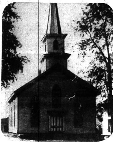
Presbyterian Church, 1860-1916