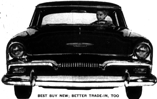
BEST BUY NEW; BETTER TRADE-IN, TOO

Plymouth judged "America's Most Beautiful Car" by famous professional artists, the Society of Illustrators