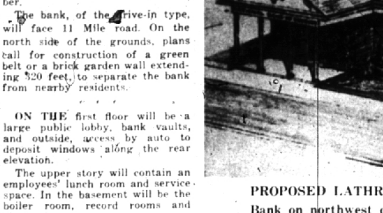
PROPOSED LATHRUP BRANCH OF NATIONAL BANK OF DETROIT Bank on northwest corner of Southfield and 11 Mile will cost $170,000.

LATHRUP—A permit was issued Monday by the Village to the National Bank of Detroit, to allow them to build a $170,000 branch office on the northwest corner of Southfield and 11 Mile roads.