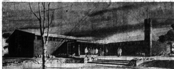
ARCHITECT OFFERS CONTEMPORARY BUILDING Will break ground in near future for first unit