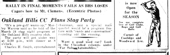
RALLY IN FINAL MOMENTS FAILS AS BHS LOSES Cagers bow to Mt. Clemens.

HOWEVER, a rally late in the game fell just short and the Bears won 61-57. Thursday's first game matched Birmingham and Mt. Clemens for the first time of the season, each team having won one of the two previous meetings. Mt. Clemens pushed to an early advantage which was maintained until the third period. However,