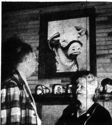
PAINTING OF BULL KEYS SIRLOIN ROOM Artworks added to new home

Society deadline is 3 p.m. each Tuesday.