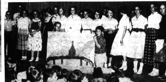
SIXTH GRADERS at Walnut Lake School take part in school affairs for the last time. Next year, the group that is pictured above, will begin junior high school. The group, in farewell to their schoolmates, put on a skit which outlined the class's history from kindergarten to the present day.