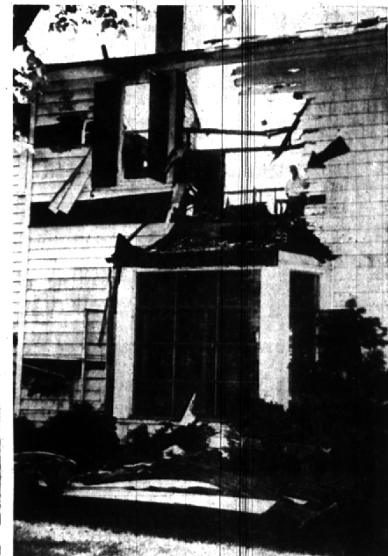
THRU THE HOLE in the wall of the second floor library looks Ernest Keen (arrow at right) following the $100,000 fire last week at his father's home on E. Long Lake road, Bloomfield township.