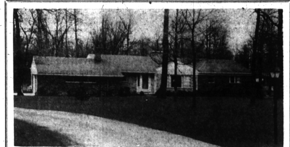
3816 LINCOLN DRIVE