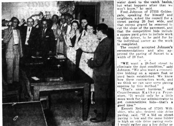
SENATOR William Broomfield (right) swears into office the nine Charter Commission Members in Southfield.

There is a pre-program clean-up the ball diamond, paint apparatus planned for Sat. a.m. June 25 when and ready things in general. Your the parents will pitch in and rake cooperation is solicited.