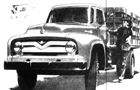
Sales record breaking "11-tonner," Ford F-500, GVW 14,000 lbs. Payload capacity (with body) up to 9,464 lbs. Electric-shift 2-speed rear axle available.