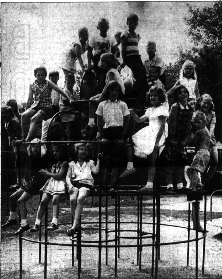
TWO DOZEN LITTLE TARZANS climb around the five-tier metal monster known as "Jungle Gym" in the area playgrounds. The "Jungle Gym" now is considered by the Birmingham Board of Education a

To grow mentally and spiritually one needs to spend some time in quiet meditation, away from the noise and jungle of the materialism of life. It is surprising how much wonderful good one thus acquires.