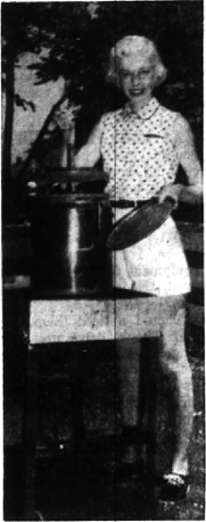
RACKS HOLD SHRIMP Cooking in metal