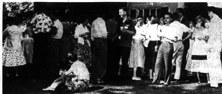
TIRED, THIRSTY YOUNGSTERS FROM ABROAD FLOCK TO PUNCH BOWL. A most welcome treat, a cold drink, after long bus trip