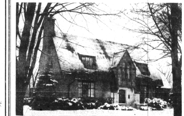
316 SOUTH GLENHURST