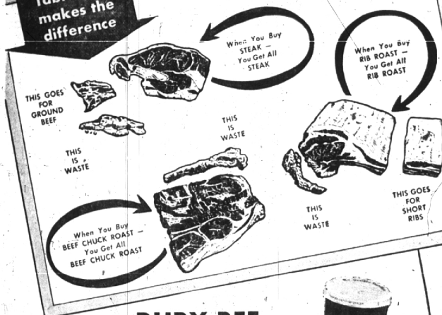
Table-Trim makes the difference