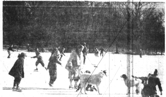
BRIGHT SUN and a frozen pond—what could be better? A group of youngsters, with a few dogs to add to the excitement, made a busy picture on a small pond near Charing Cross road Sunday as they took advantage of good ice and a sparkling winter's day. While small folks slipped and tumbled on one section of the pond, more adept skaters staged an impromptu hockey game, some speed skating and a bit of fancy footwork in other areas. Flashing smiles, red cheeks and happy shouts gave evidence as to just how much the day was being enjoyed.

Want a good used car? Look in the Classified columns under "For Sale—Automobiles."