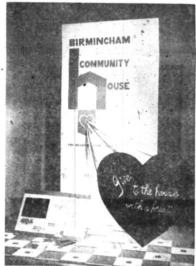
MERCHANTS' participation in the Roll Call is typified by this window at Jacobson's.

These facts, and others, are the things which these special activities groups pictured here are taking to area residents during this 1955 Roll Call.