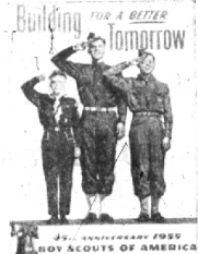
BOY SCOUTS OF AMERICA