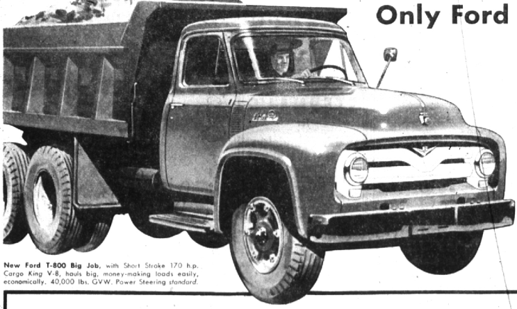
New Ford 1-800 Big Job, with Short Stroke 170 h.p. Cargo King V-8, hauls big, money-making loads easily, economically, 40,000 lbs. GVW. Power Steering standard.

Only Ford Trucks—the new Money Makers—give you five, proved modern Short Stroke engines! Plus important new advancements to better keep Ford Trucks making money around the calendar, around the clock!