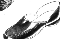
BOY'S BROWN LEATHER SLIPPER Soft, cozy, warm, $3.75 in a host of colors $3.75