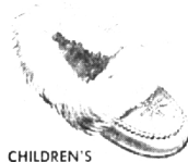
CHILDREN'S LEATHER MOCCASIN Soft, cozy, warm, $3.95 in a host of colors $3.95