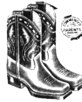
COWBOY BOOTS Soft, cozy, warm, $3.75 in a host of colors $3.75