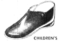
CHILDREN'S FAUST SLIPPER Soft, cozy, warm, $3.75 in a host of colors $3.75