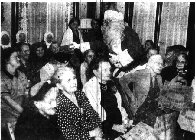
SANTA WAS THERE, too, and handed out little gifts to each of the St. Elizabeth residents. The home is the former 30-acre