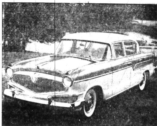
THIS NEW 1956 Hudson Hornet custom four-door sedan illustrates the V-line styling prevalent throughout the new Hudson series. The new line also includes a custom two-door Hollywood hardtop Hornet V-3; a super and custom four-door and custom two-door Hollywood hardtop in the Hornet "Six".