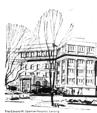
The Edward W. Sparrow Hospital, Lansing