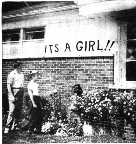
IT'S A GIRL!!