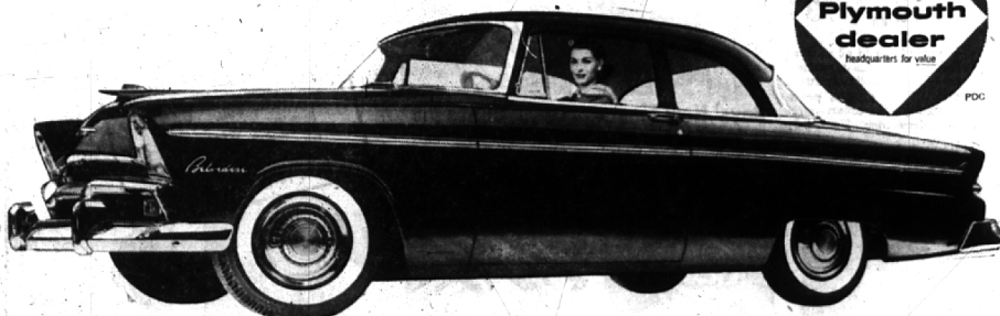
Actual photo of the Plymouth Belvedere Club Sedan. Ask your Plymouth dealer for the low price on this and twenty-one other smart Plymouth models.