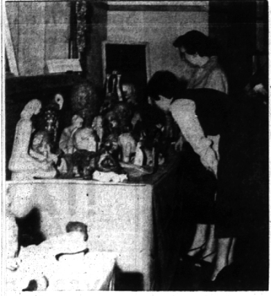
TWO UNIDENTIFIED spectators stop at the ceramics table for a closer inspection of the near-professional display of work in that particular Community House program. The annual exhibit, held last week, included millinery, sewing, art, silverwork and an "advance" on the proposed Saturday morning gardening class which Alice Wessels Burlingame will start soon for men. Hundreds visited the exhibit, many expressing delight at the outstanding talents of area residents.