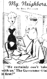
My Neighbors... Illustration of a person sitting at a desk with a sign that says 'My Neighbors'.