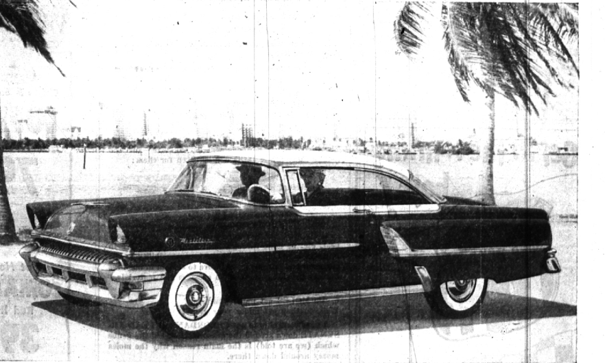
MERCURY MONTCLAIR HARDTOP COUPE (Above). This low-silhouette coupe—only 58 1/2 inches high—typifies future styling that keeps Mercury ahead in style. Mercury offers 11 models in 3 great series, including all-new Montclair 4-door Sedan—"hardtop" beauty with 4-door convenience.