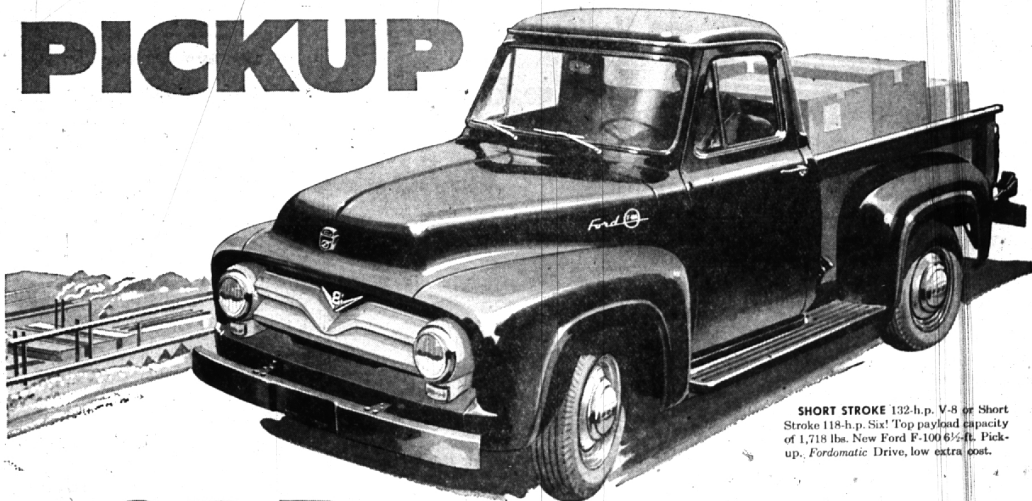
SHORT STROKE 132-h.p. V-8 or Short Stroke 118-h.p. Six! Top payload capacity of 1,718 lbs. New Ford F-100 6 1/2 ft. Pickup. Fordomatic Drive, low extra cost.