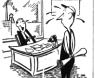
"How's this... You find the guaranteed annual customers. I'll give you the factory—you pay me a guaranteed annual wage!"