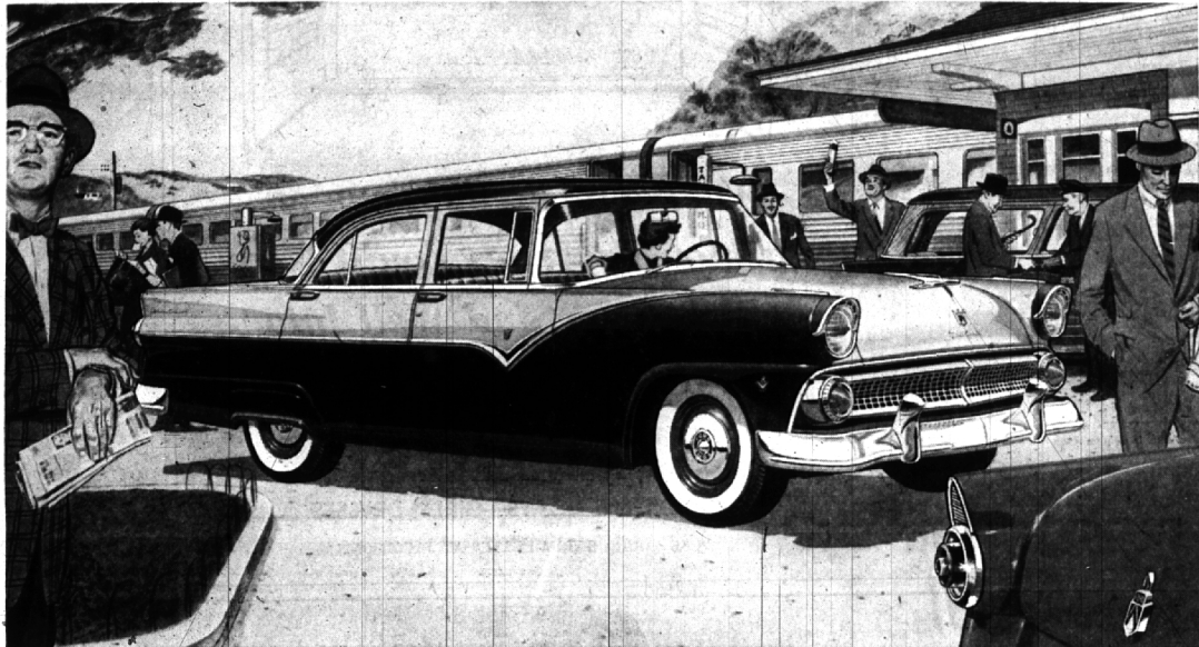
Ford's new Fairlane Town Sedan illustrated above, sets the fashion note wherever it goes

Chances are: If you don't own a Ford you haven't driven one lately!