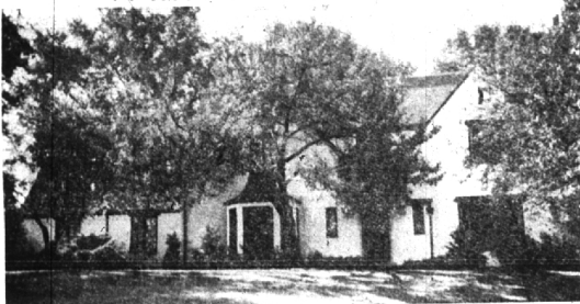
"BY A DAM SITE"

Overlooking the Rouge Dam in an enchanted world of its own on 4 1/2 acres of exquisitely landscaped grounds! This home, built by Master Craftsmen, has 3 airy, family size bedrooms, plus 2 additional bedrooms for children or maid's quarters—3 decorator baths plus lavatory! Its library is fit for a king with fireplace and inlaid paneling, ceiling included! Newly installed custom kitchen—a homemakers delight! Extras for luxurious, gracious living include carpeting, drapes, and copper sprinkling system.