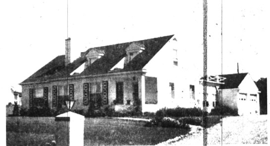
Over an acre

New England Cape Cod in the heart of Bloomfield . . . overlooking Forest Lake Country Club . . . near the rolling fairways. Hospitality greets you at the front door.