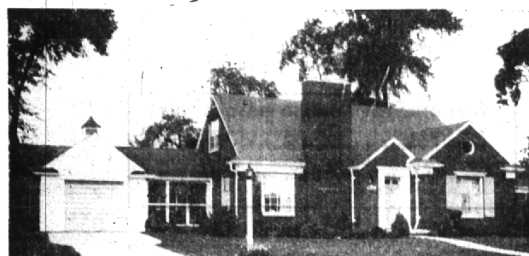
It's only $31,500!