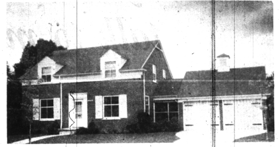
In Beverly Hills

Construction for a life-time of service . . . that's what you'll find here. Larger than the picture indicates, it contains: