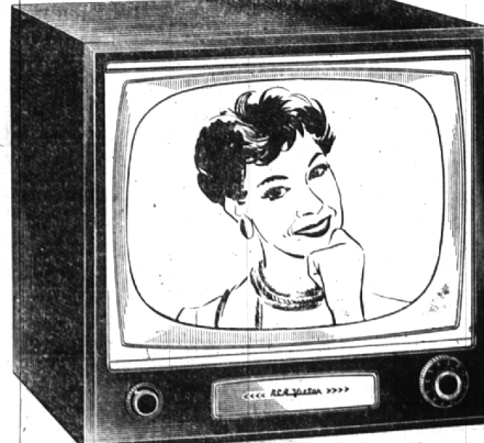
Model 215501 $199.95