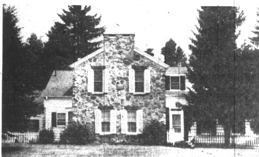
645 Arlington Drive

Majestic Blue Spruces... the traditional charm of Early American Farm-houses... the beauty of Corvett Park... blend into perfect harmony. Soft-hued decorating completes the picture.