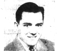
WILLIAM S. BROOMFIELD State Senator—12th District

Donald S. Leonard offers a program of action for Michigan. 1. By the summer of 1955, work must start on a huge new highway construction program. 2. During the 1955 legislative session, development of an adequate school program. 3. The immediate creation of an over-all Seaway Planning Commission to integrate all planning for the St. Lawrence Seaway in Michigan. 4. An over-all examination of the tax structure to keep the budget in balance without new taxes. And Don Leonard, working with your Legislators will get this job done!