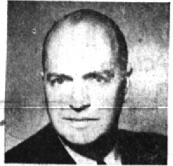
DONALD S. LEONARD For Governor

Donald S. Leonard offers a program of action for Michigan. 1. By the summer of 1955, work must start on a huge new highway construction program. 2. During the 1955 legislative session, development of an adequate school program. 3. The immediate creation of an over-all Seaway Planning Commission to integrate all planning for the St. Lawrence Seaway in Michigan. 4. An over-all examination of the tax structure to keep the budget in balance without new taxes. And Don Leonard, working with your Legislators will get this job done!