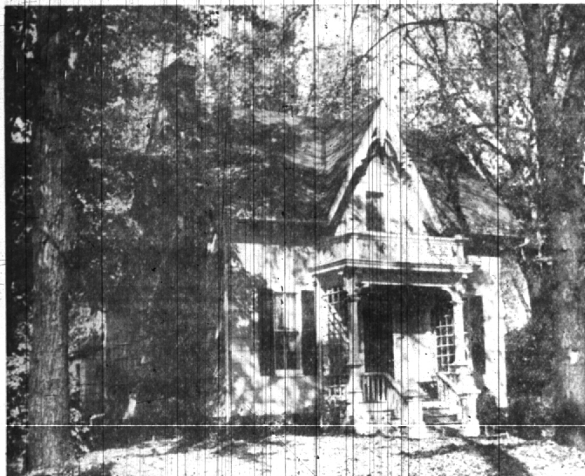
VILLAGE BLACKSMITH LIVED IN THIS HOUSE FROM 1879-1905 On north side of Willets, just east of Chester street.