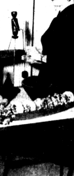
gaged and all small children of the area are in for a treat.

A new feature will be added to the "Holiday Fair" of Community Church (Congregational), Southfield road, to be held on Dec. 4 from 11 a.m. to 7 p.m. The T.Y.P.S. senior high school Young Peoples' society is sponsoring pony rides for young children. Shetland ponies have been en-