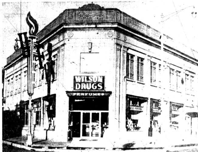
Modern New Front Entrance