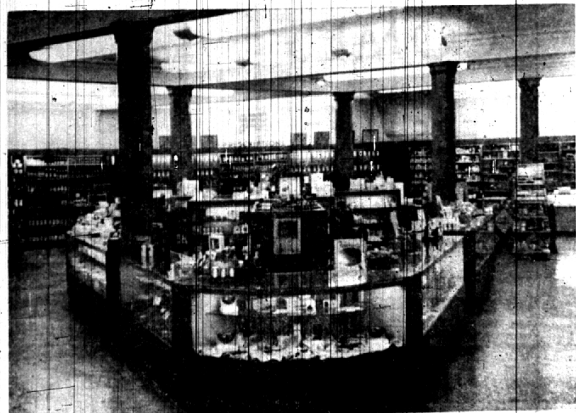
BRIGHT NEW LOOK GREET'S WILSON DRUG PATRONS Store interior was completely redecorated