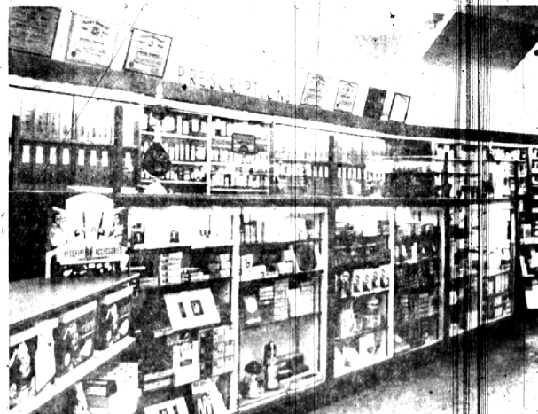
Our Enlarged Prescription Department

A Complete - BEVERAGE DEPARTMENT For Your Convenience In Charge of DICK ERWIN