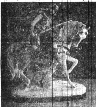
Royal Dutch Horse and Rider, 13" Long 17" High

Select distinctive mementos for your friends this Christmas, from our wide variety of imported gifts from all over the world.