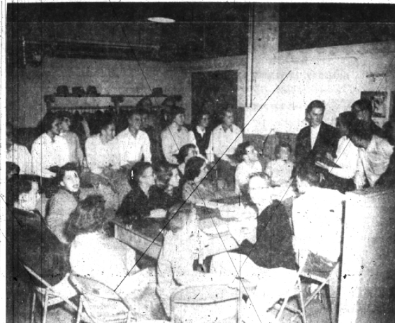
J-AD COMPANY EMPLOYEES IN BRIEFING MEETING. Complete ad agency works in crowded quarters.