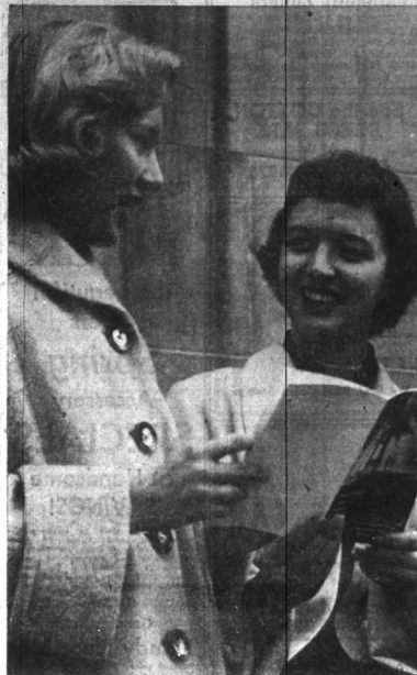
Exhibit Home Is Opened on Shirley Farms

At Shirley Farms, a 40-home colony of custom styled homes on Wing Lake road, the Gordon Williamson Co. is presenting a new exhibit home designed by Henckes & Lorenz.