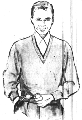
Made in Scotland by J. D. McGeorge Ltd.

HIGGINS and FRANK are proud to announce the arrival of a shipment of the finest blended sweaters in the world. Full fashioned and hand framed.