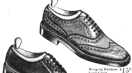
Wing-tip Random $15.95 Long-Grain