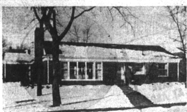
MOST OUTSTANDING LOCATION FOR RANCH HOMES IN BIRMINGHAM

FREE ESTIMATES 25 YEARS EXPERIENCE TO 5-5691