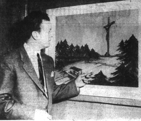
"THE SCULPTOR DRAWS" Marshall Fredericks exhibits at Little Gallery.

Between Hunter & Adams — 5 Blocks South of Maple Hours 7:30 to 5:30 Mon. thru Fri.; 7:30 to 1:00 Sat.