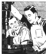
Father-and-son teamwork puts long life into every Studebaker

STUDEBAKER THE GREAT INDEPENDENT... PIONEER AND PACEMAKER.