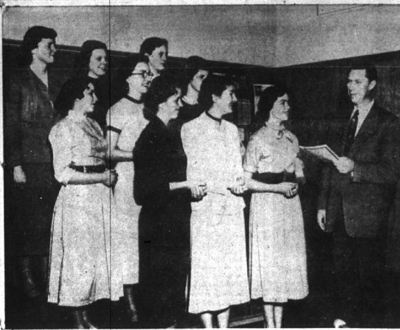
BLOOMFIELD HILLS HIGH SCHOOL'S NEWLY FORMED TRIPLE TRIO Wins superior rating in vocal festival at Pontiac