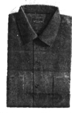
ARCTIC MESH. Cool combed cotton mesh. Trim tailored. For easy-comfort fit. In 6 choice colors. . . . $3.95

LIVING IS EASY in these character cotton sportshirts by world famous McGregor. THEY'RE EASY TO WEAR . . . cool, comfortable, light in weight. THEY'RE EASY TO WASH . . . won't shrink, guaranteed colorfast. THEY'RE EASY ON THE EYES . . . colorful, smart. New plaids, checks, sheers and meshes. THEY'RE EASY-FITTING . . . complete sizes to fit every man . . . casually, correctly. THEY'RE EASY ON YOUR WALLET, TOO . . . popular priced from $3.00 to $5.95