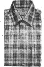
TT 604. Sparkling authentic white madras with exclusive Italian Riviera collar. Your choice of assorted patterns . . . $5.95