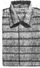
MOSQUE. Very lightweight cotton that looks like flannel. Woven pattern of for cooler custom-mades . . . $5.00