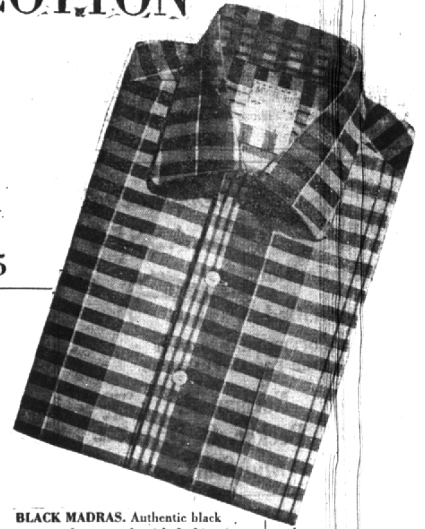
BLACK MADRAS. Authentic black warp madras . . . truly rich looking. Your choice of red, blue, yellow. . . . $5.00