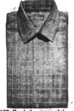
TT 609. Here's the newest of the new . . . the exclusive Italian two way collar. Sheer tan, blue and grey . . . $5.95