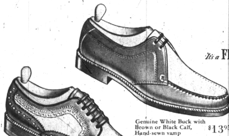
Genuine White Buck with Brown or Black Calf, Hand-sewn vamp $13.95