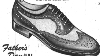
Genuine White Buck with Brown or Black Calf $18.95

This year, put yourself into footwear that will really "go places" and influence people! Cool self-assurance is built right into every pair of wonderful feeling FREEMAN'S. Smartest, best-balanced Brown 'n' Whites and Black 'n' Whites we've seen!