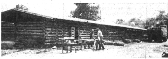
WORKMEN FINISH NEW STABLES AT HUNT CLUB Better housing for show horses