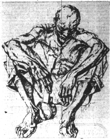
THE BANJO PLAYER A typical de Erdely drawing