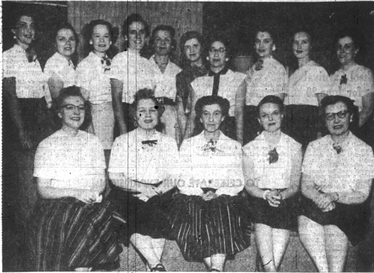
LATHRUP SINGERS—THE CHORALETTES. Singing group organized 1951.